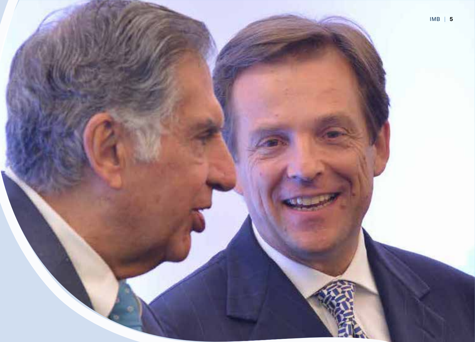
Ratan N Tata | Chairman of Tata Trusts